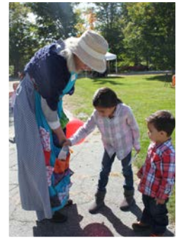
The "Pocket Lady" had surprises for the children in her many pockets

It has been a pleasure to work closely with the core group of Shaker Harvest Festival organizers to put together a very successful event. On September 26, more than 450 festival participants ( a record number) enjoyed the pristine early autumn day with many activity choices. The children rode ponies and whole families took wagon rides. Adults and children hand-pressed apple cider and made apple cider ice cream. It was delightful to see the children wearing the harvest masks and crowns they had created, while their parents and grandparents carefully guarded their handmade fairy houses.