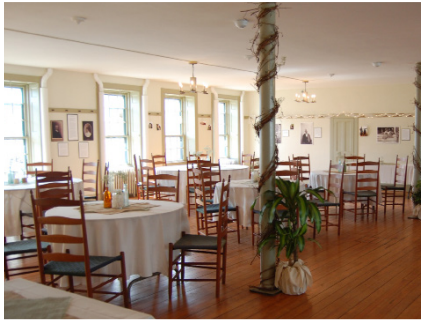
Shaker Meeting Room decorated for a wedding reception.

As the beauty of our site and the diversity of buildings and outdoor spaces continue to be appreciated by newly engaged couples, we are steadily filling up for ceremonies and celebrations for the coming year. We had a great wedding season and I was again fortunate to be a part of many couples' big days (or big weekends)!