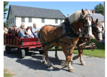
Horse drawn hay wagon rides at the Harvest Festival.