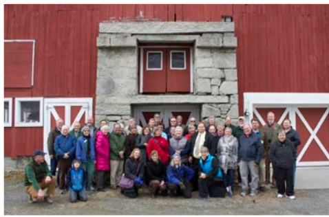
Tour of the 1854 Cow Barn at last year's Spring Shaker Forum.

The Enfield Shaker Museum's Annual Forum on the Shakers will be held on April 22 – 24, 2016. The Museum is seeking proposals for papers and presentations for Saturday, April 23 from 9 am – 4 pm. Preference will be given to proposals based on primary sources such as, but not limited to, journals, ledger books, oral histories, newspapers, artifacts, correspondence and maps. Each lecture must be no more than 45 minutes with an additional 15 minutes for questions and answers. Shaker Workshops will once again award a $500 cash prize to the presenter demonstrating the highest standard in new, outstanding scholarship. All presenters will receive a free weekend package.