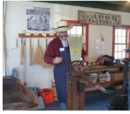
Traditional Shaker Broom Making demonstration.

self-sustainable communal living, ingenious inventions and entrepreneurial practices, work ethics, and devotion to a spiritual life, I am working with the other Museum staff, Shaker scholars and knowledgeable volunteers to develop a robust selection of educational opportunities.