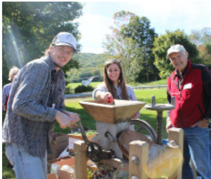
Museum volunteers pressing apple cider at the Harvest Festival.