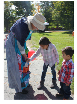
The "Pocket Lady" had surprises for the children in her many pockets

It has been a pleasure to work closely with the core group of Shaker Harvest Festival organizers to put together a very successful event. On September 26, more than 450 festival participants (a record number) enjoyed the pristine early autumn day with many activity choices. The children rode ponies and whole families took wagon rides. Adults and children hand-pressed apple cider and made apple cider ice cream. It was delightful to see the children wearing the harvest masks and crowns they had created, while their parents and grandparents carefully guarded their handmade fairy houses.