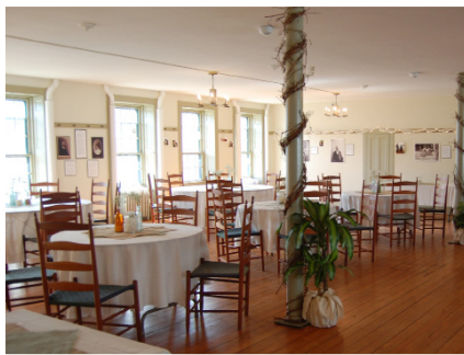
Shaker Meeting Room decorated for a wedding reception.

As the beauty of our site and the diversity of buildings and outdoor spaces continue to be appreciated by newly engaged couples, we are steadily filling up for ceremonies and celebrations for the coming year. We had a great wedding season and I was again fortunate to be a part of many couples' big days (or big weekends)!