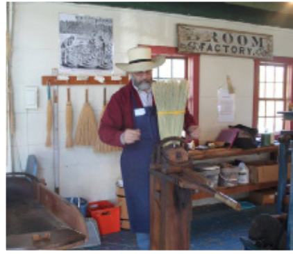
Traditional Shaker Broom Making demonstration.

self-sustainable communal living, ingenious inventions and entrepreneurial practices, work ethics, and devotion to a spiritual life, I am working with the other Museum staff, Shaker scholars and knowledgeable volunteers to develop a robust selection of educational opportunities.