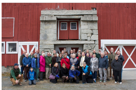
Tour of the 1854 Cow Barn at last year's Spring Shaker Forum.

The Enfield Shaker Museum's Annual Forum on the Shakers will be held on April 22 – 24, 2016. The Museum is seeking proposals for papers and presentations for Saturday, April 23 from 9 am – 4 pm. Preference will be given to proposals based on primary sources such as, but not limited to, journals, ledger books, oral histories, newspapers, artifacts, correspondence and maps. Each lecture must be no more than 45 minutes with an additional 15 minutes for questions and answers. Shaker Workshops will once again award a $500 cash prize to the presenter demonstrating the highest standard in new, outstanding scholarship. All presenters will receive a free weekend package.