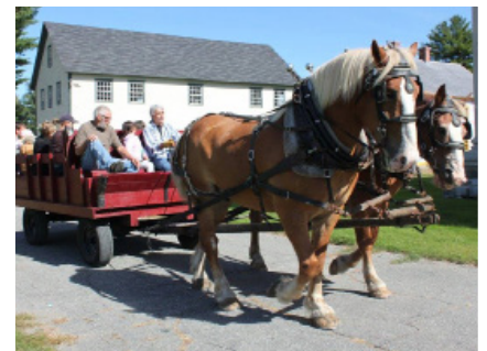
Horse drawn hay wagon rides at the Harvest Festival.