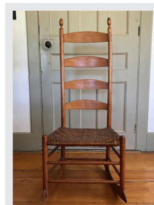
Recently acquired four-slat armless Enfield rocker.