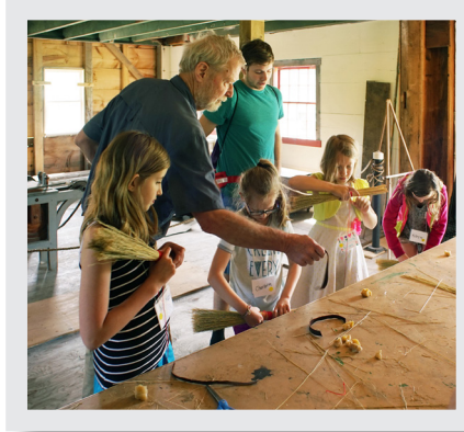
Broom making during a History Alive field trip.

T. Brundage Charitable, Scientific, and Wildlife Conservation Foundation. This grant will support a wide array of programs including the Harvest Festival, the children's garden, and interactive stations that will allow visitors to the site, especially children, to experience the Enfield Shaker Museum in a more hands-on way. During the summer of 2018, we will once again offer our high school and junior high school